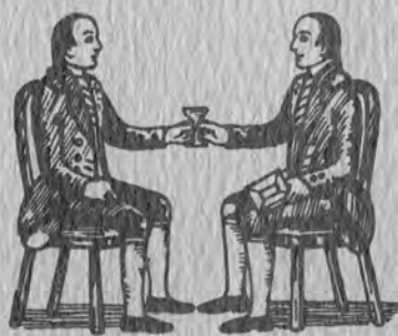
MOSES AND AARON WILCOX TWIN BROTHERS